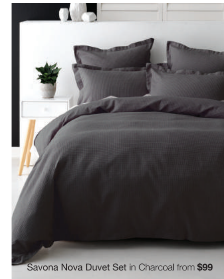
Savona Nova Duvet Set in Charcoal from $99

opposite a Savona Nova Duvet Set in White from $99 b Savona Nova Eurocase in White $24