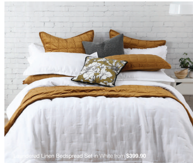
Laundered Linen Bedspread Set in White from $399.90

opposite a Laundered Linen Bedspread in Pewter from $399.90 b Laundered Linen Sheet Set in White from $369.90 c Arlette Eurocase Set $99.90 d Aviana Eurocase Set in Rose $79.90 e Arlette Cushion $119.90 f Arlette Cushion $119.90 g Chambray Throw in Grey $179.90