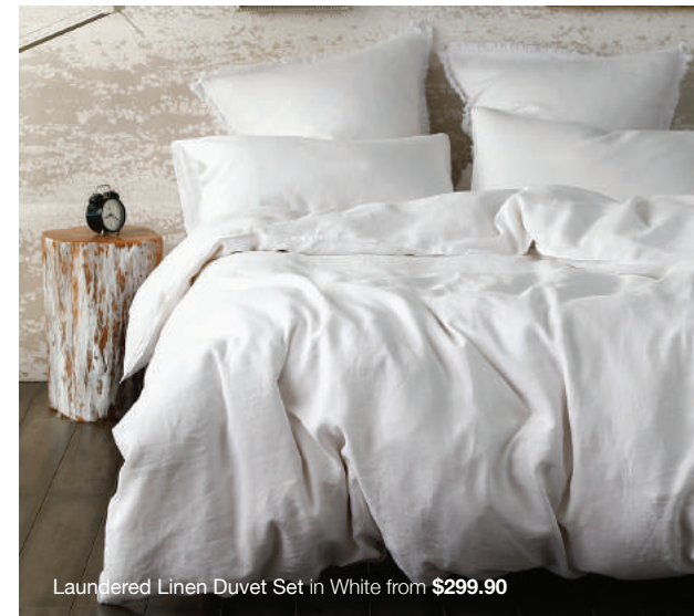
Laundered Linen Duvet Set in White from $299.90

Indulge in the luxury of 100% pure linen bedding. Pre-washed for ultimate softness Laundered Linen looks as good as it feels, pair it with Laundered Linen accessories and sheets to complete your look.