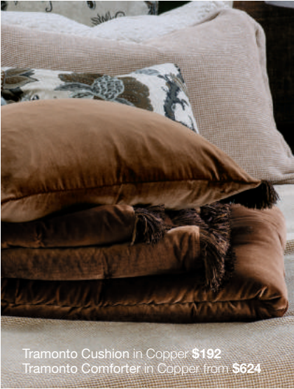
Tramonto Cushion in Copper $192 Tramonto Comforter in Copper from $624