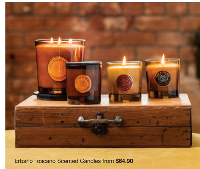
Erbario Toscano Scented Candles from $64.90