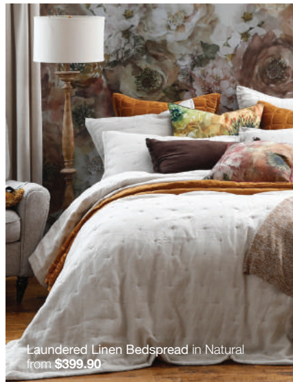
Laundered Linen Bedspread in Natural from $399.90

With a beautiful design featuring winter roses in a soft warm colour palette, the 300 thread count pure cotton sateen Arlette Duvet Cover is a perfect modern floral design.