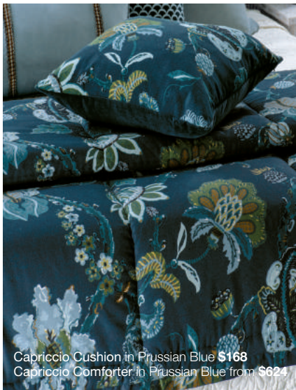
Capriccio Cushion in Prussian Blue $168 Capriccio Comforter in Prussian Blue from $624

A simple façade opening to a heavily ornamented interior inspires this charming machine quilted bedspread in a timeless ivory colourway featuring satin stitch embroidery for a touch of charm.