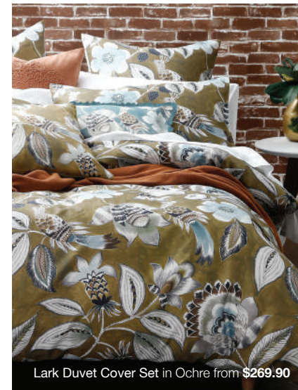
Lark Duvet Cover Set in Ochre from $269.90