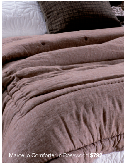
Marcello Comforter in Rosewood $792