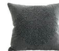
middle Auro Cushion in Charcoal $119.90