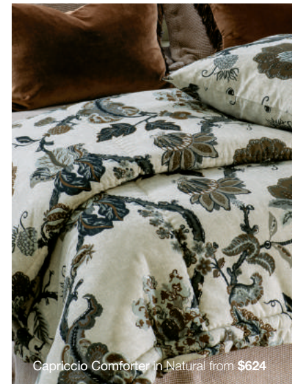
Capriccio Comforter in Natural from $624