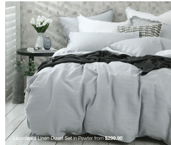
Laundered Linen Duvet Set in Pewter from $299.90

opposite a Laundered Linen Duvet Set in Natural from $299.90 b Laundered Linen Sheet Set in Natural from $369.99 c Laundered Linen Tassel Pillowcase Set in White $99.90 d Laundered Linen Tassel Eurocase Set in Natural $139.90