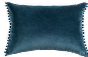
middle Mateo Cushion in Prussian Blue $168