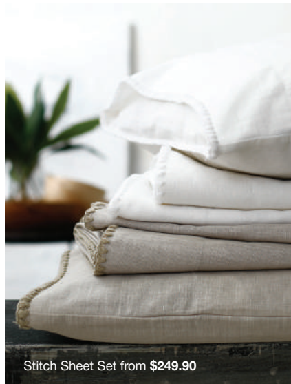
Stitch Sheet Set from $249.90