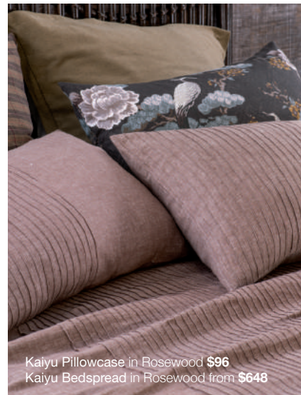
Kaiyu Pillowcase in Rosewood $96 Kaiyu Bedspread in Rosewood from $648

Kaiyu is understated and timeless. Its pin tucked detailing perfectly complements the charming Seafoam and Rosewood coloured linen chambray for an elegant bed setting.