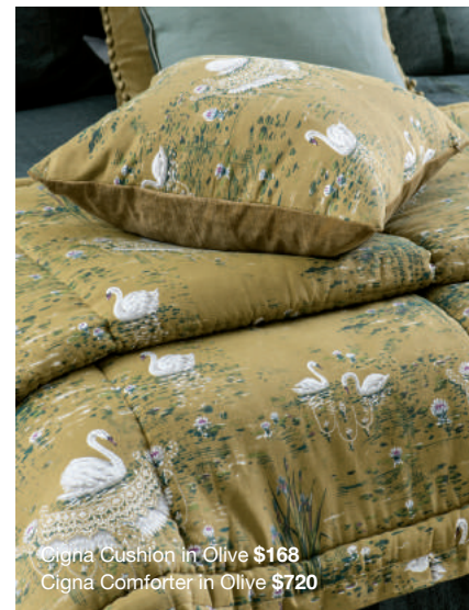
Cigna Cushion in Olive $168 Cigna Comforter in Olive $720