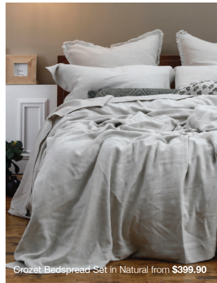
Crozet Bedspread Set in Natural from $399.90

Featuring pretty hummingbirds set amongst large scale florals with a soft painterly effect in a serene colour palette of teal blue and cream, Avital adds a touch of beauty to your bedroom.