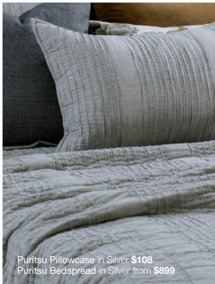
Puritsu Pillowcase in Silver $108 Puritsu Bedspread in Silver from $899