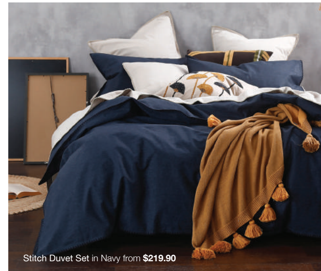
Stitch Duvet Set in Navy from $219.90

Constructed in beautiful linen cotton, Stitch features a distinctive blanket stitch edge and rich texture, adding visual layers and interest to bed time.