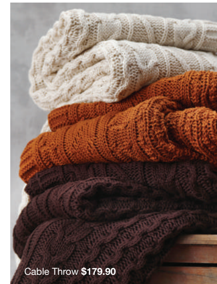
Cable Throw $179.90