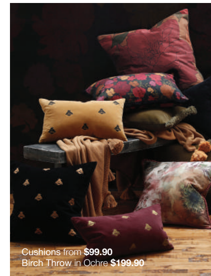
Cushions from $99.90 Birch Throw in Ochre $199.90

opposite a Florentina Bedspread Set in Sycamore from $399.90 b Birch Throw in Navy $199.90 c Meeka Pillowcase (from Comforter Set) in Sycamore from $329.90 d Sabel Cushion in Mustard $149.90 e Buzz Cushion in Black $99.90 f Fi Cushion $119.90 g Meeka Eurocase Set in Sycamore $99.90