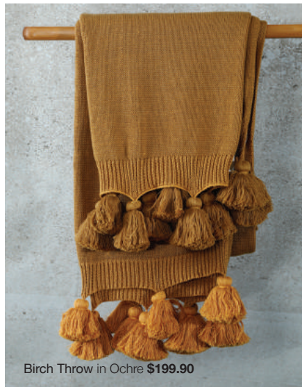
Birch Throw in Ochre $199.90