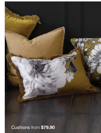
Cushions from $79.90

opposite a Reine Duvet Set from $269.90 b Birch Throw in Ochre $199.90 c Reine Cushion $119.90 d Sabel Cushion in Mustard $139.90 e Reine Eurocase Set $99.90