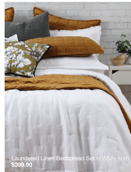
Laundered Linen Bedspread Set in White from $399.90

Reine makes a statement with its large-scale floral blooms in a sophisticated colour palette of charcoal tones against a soft mustard background and plain white reverse.