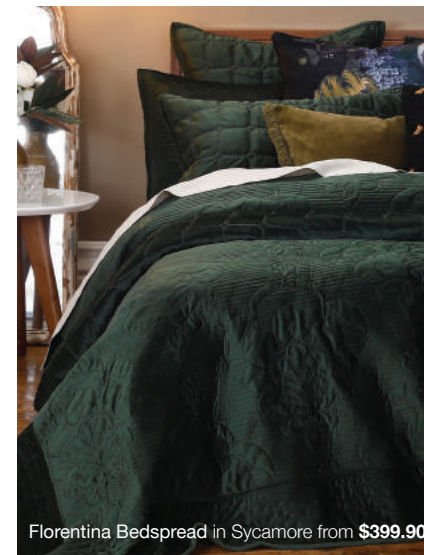
Florentina Bedspread in Sycamore from $399.90