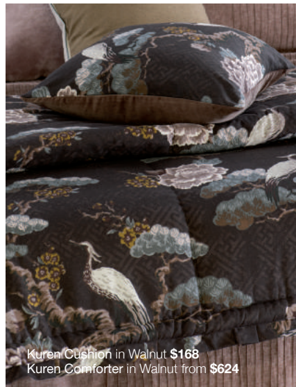
Kuren Cushion in Walnut $168 Kuren Comforter in Walnut from $624

The beautiful crisp white cotton Feza bedspread is inspired by a dance of cranes displaying their magnificent wing span as they soar in the rising air and features signature French knot clusters.