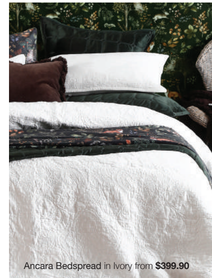
Ancara Bedspread in Ivory from $399.90

A whimsical design depicting creatures at play in a country garden in a beautiful, rich combination of deep natural colours that will make your mind wander.