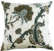
top Melodie Cushion in Ivory $168 middle Tramonto Cushion in Copper $192 bottom Capriccio Cushion in Natural $168