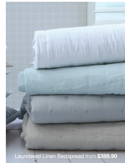
Laundered Linen Bedspread from $399.90

Inspired by the charm of yesteryear art and fabric design, Floz is a bold, modern take on a floral print that pops with its contrasting colour palettes.