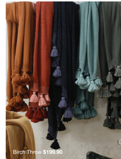
Birch Throw $199.90

opposite a Lark Duvet Cover Set in Teal from $269.90 b Cable Throw in Coffee $179.90 c Malta Cushion in Mist $149.90 d Sabel Cushion in Teal $139.90 e Stitch Eurocase Set in White $99.90