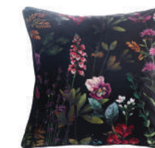
top Melody Cushion $89.90 middle Sabel Cushion in Umber $149.90 bottom Maisie Cushion $119.90