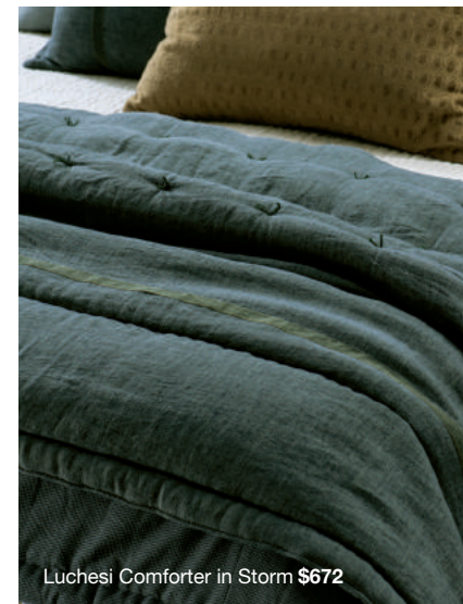
Luchesi Comforter in Storm $672