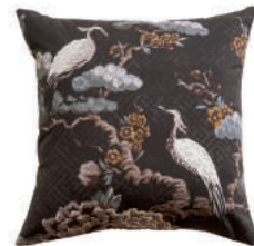
top Capriccio Cushion in Copper $168 middle Arco Cushion in Antique Rose $216 bottom Kuren Cushion in Walnut $168

opposite a Feza Bedspread in White from $864 b Feza Pillowcase in White $99 c Kuren Pillowcase in Walnut $72 d Mica Eurocase in Carob $120 e Feza Eurocase in White $115