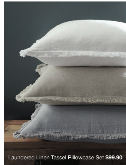
Laundered Linen Tassel Pillowcase Set $99.90