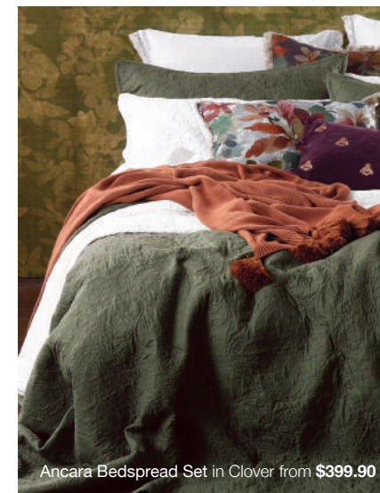
Ankara Bedspread Set in Clover from $399.90

The Ankara bedspread will bring a tailored look to your interior. This beautiful embroidered design makes a statement on its own or perfectly paired with a floral comforter.