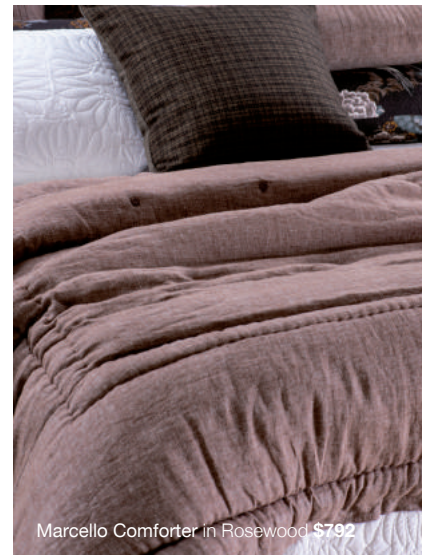
Marcello Comforter in Rosewood $792

opposite a Kaiyu Bedspread in Seafoam from $648 b Kaiyu Comforter in Seafoam from $699 c Kaiyu Cushion in Seafoam $168 d Arco Cushion in Prussian Blue $216 e Capriccio Pillowcase in Prussian Blue $72 f Mateo Eurocase in Prussian Blue $120 g Kaiyu Eurocase in Seafoam $108