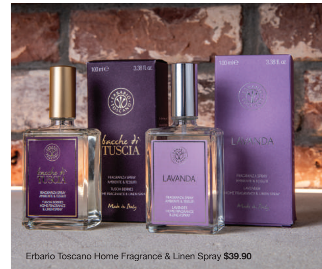
Erbario Toscano Home Fragrance & Linen Spray $39.90

opposite a Erbario Toscana Fragrance Diffuser in Pepe Nero, Bacche di Tusia, Salis, Vanilla Piccante, Fiori di Mimosa, & Pino Toscano from $69.90