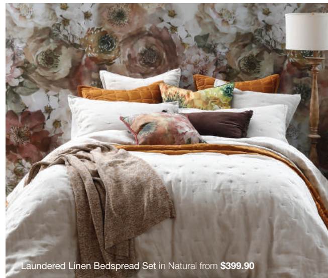
Laundered Linen Bedspread Set in Natural from $399.90

Indulge in the luxury of a 100% pure linen bedspread. Pre-washed for ultimate softness with delicate pin tucks and a cotton reverse, Laundered Linen looks as good as it feels.