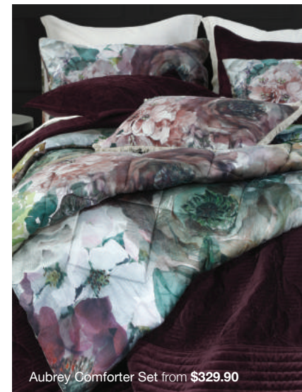
Aubrey Comforter Set from $329.90

Aubrey is the cornerstone print of the MM Linen Signature collection. Featuring winter roses in a colour palette of deep mauves, greys and greens it evokes a lovely feeling of warmth.