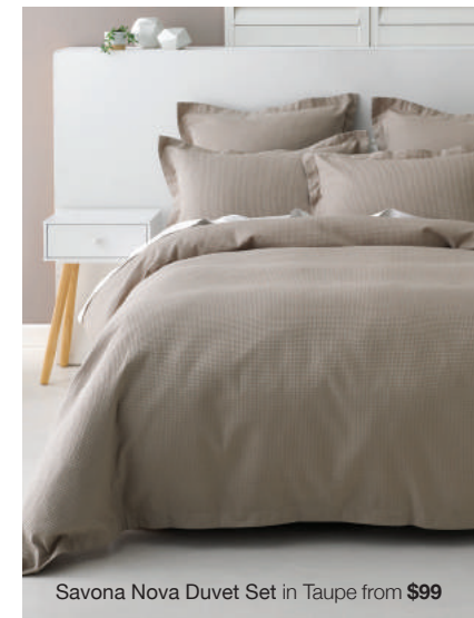
Savona Nova Duvet Set in Taupe from $99