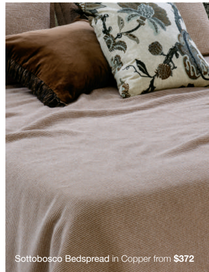
Sottobosco Bedspread in Copper from $372

Sottobosco is the perfect, effortless and uncomplicated bedspread. Reflecting organic textures found in nature, it embodies simplistic style with its waffle weave in three timeless colourways.