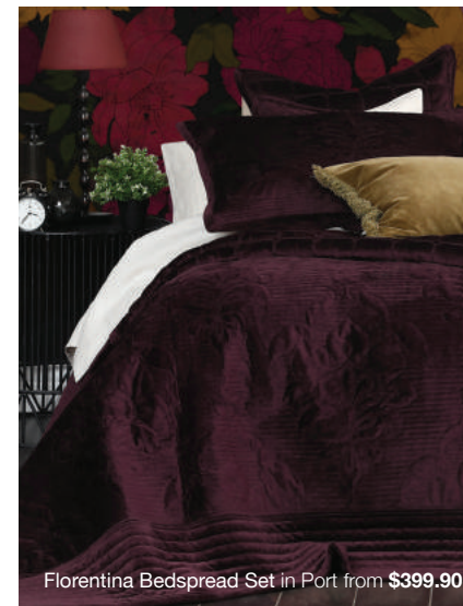
Florentina Bedspread Set in Port from $399.90

The classic design of the Florentina bedspread, expertly embroidered onto a luxurious velvety fabric, in rich port and earthy Sycamore colourways will bring warmth and texture to your interior.