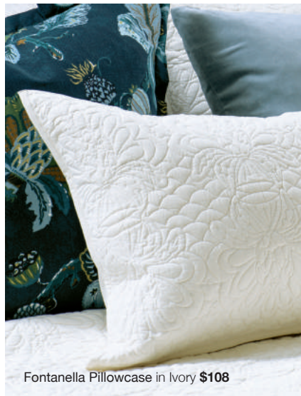
Fontanella Pillowcase in Ivory $108