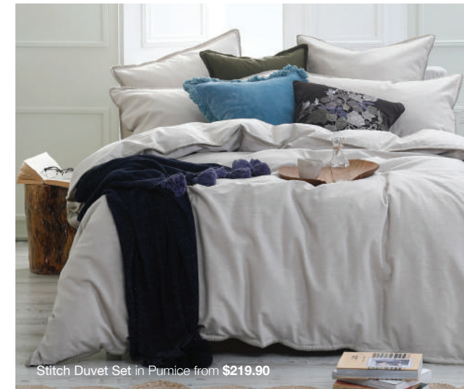
Stitch Duvet Set in Pumice from $219.90

opposite a Stitch Duvet Cover Set in Ochre from $219.90 b Sumi Velvet Throw $199.90 c Stitch Cushion in Ochre $79.90 d Sumi Cushion $119.90 e Sabel Cushion in Olive $139.90 f Stitch Eurocase Set in Olive $99.90