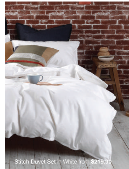
Stitch Duvet Set in White from $219.90

Inspired by its namesake, Matakana is a timeless stripe design in soft denim blue hues, woven in cotton yarn dyed fabric. The plain reverse is a crisp 250 thread count cotton percale.