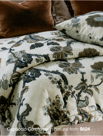
Capriccio Comforter in Natural from $624