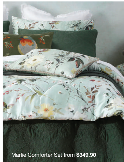
Marlie Comforter Set from $349.90

Marlie is an exquisitely soft and summery design in linen cotton featuring delicate flowers and stems, with an ivory reverse and piped edge detail to finish.