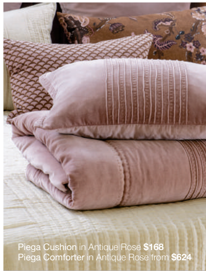
Piega Cushion in Antique Rose $168 Piega Comforter in Antique Rose from $624