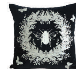
top Floz Cushion $119.90