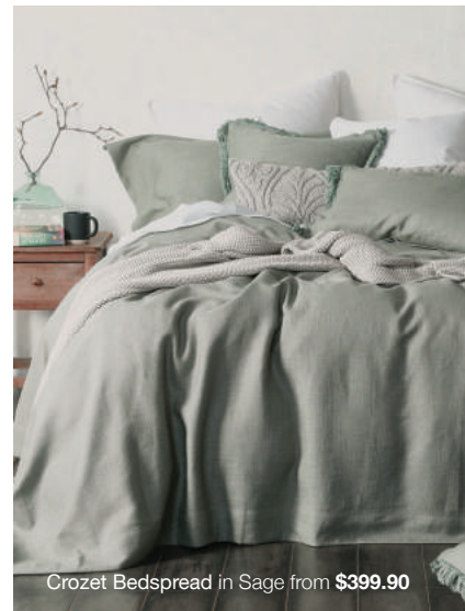
Crozet Bedspread in Sage from $399.90

The Crozet bedspread is the perfect touch of colour and texture for any bedroom scheme. In two beautiful soft colourways, it will look at home no matter your décor style.