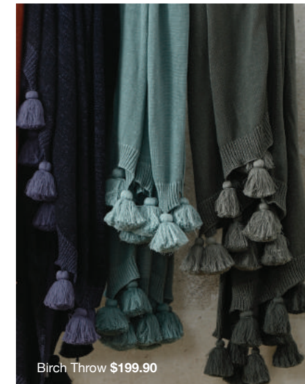
Birch Throw $199.90