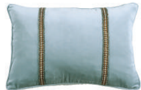
top Capriccio Cushion in Copper $168 middle Mica Cushion in Carob $216 bottom Luchesi Cushion in Smoke Blue $192

opposite a Puritsu Bedspread in Ivory from $899 b Piega Comforter in Antique Rose from $624 c Capriccio Comforter in Copper from $624 d Puritsu Pillowcase in Ecru $108 e Piega Cushion in Antique Rose $168 f Arco Cushion in Antique Rose $216 g Capriccio Pillowcase in Copper $72 h Piega Eurocase in Antique Rose $120