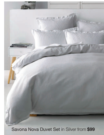
Savona Nova Duvet Set in Silver from $99

Sophisticated and timeless, the beautifully textured Savona Nova range appeals to all design aesthetics. A delicate 100% cotton waffle cover, it exudes opulent, sophisticated design.