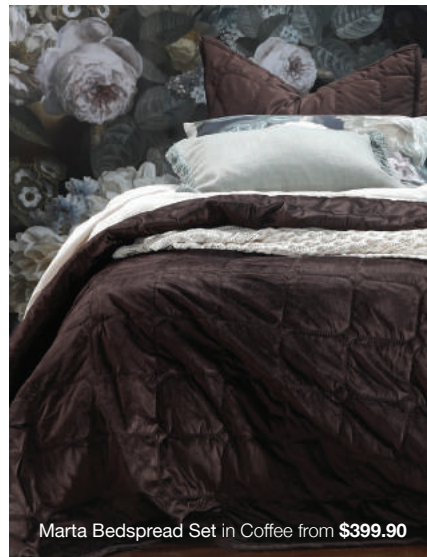
Marta Bedspread Set in Coffee from $399.90

Fiorella draws its inspiration from a beautiful country garden setting featuring a centred panel of large flowers in full bloom on a soft blush background.