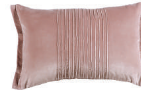
top Arco Cushion in Antique Rose $216 middle Capriccio Cushion in Natural $168 bottom Piegia Cushion in Antique Rose $168

opposite a Valentina Bedspread in White from $324 b Valentina Pillowcase in White $77