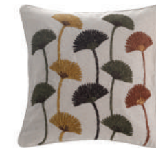
top Ammi Cushion in Multi $99.90

opposite a Reine Duvet Set from $269.90 b Birch Throw in Ochre $199.90 c Reine Cushion $119.90 d Sabel Cushion in Mustard $139.90 e Reine Eurocase Set $99.90