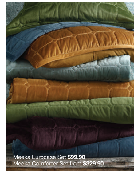
Meeka Eurocase Set $99.90 Meeka Comforter Set from $329.90