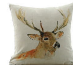
top Felix Cushion $119.90