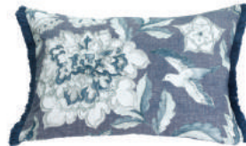
top Katiana Cushion $99.90