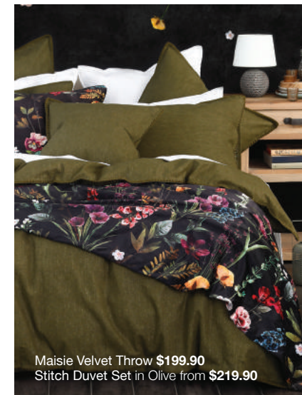
Maisie Velvet Throw $199.90 Stitch Duvet Set in Olive from $219.90

Drawing inspiration from the Christchurch Botanic Gardens, Maisie is a profusion of spring colours and delicate florals contrasted with a dark, moody background that will add depth and colour.