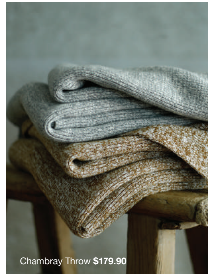
Chambray Throw $179.90

opposite a Crozet Bedspread in Natural from $399.90 b Malta Cushion in Thyme $149.90 c Hagley Cushion $89.80 d Laundered Linen Tassel Eurocase Set in Natural $139.90