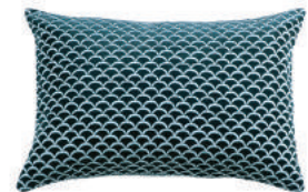
bottom Arco Cushion in Prussian Blue $216