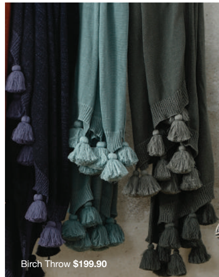
Birch Throw $199.90