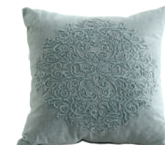
top Stitch Cushion in Cypress $79.90 middle Aubrey Cushion $119.90 bottom Auro Cushion in Laurel $119.90

opposite a Aubrey Duvet Set from $239.90 b Meeka Comforter Set in Port from $269.90 c Stitch Cushion in Cypress $79.90 d Lacey Eurocase in Ivory from $79.90 e Meeka Eurocase Set in Port $99.90