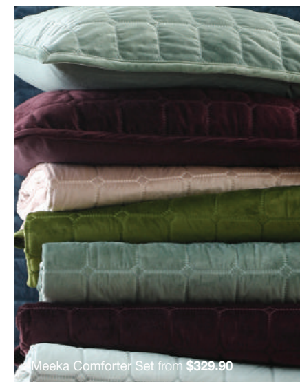
Meeka Comforter Set from $329.90