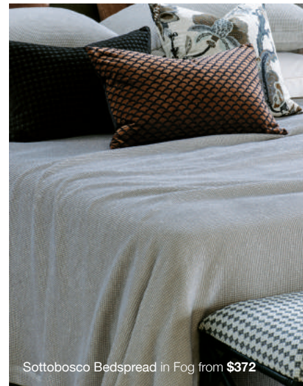
Sottobosco Bedspread in Fog from $372

opposite a Sottobosco Bedspread in Indigo from $372 b Luchesi Comforter in Smoke Blue from $672 c Sottobosco Pillowcase in Indigo $96 d Capriccio Cushion in Prussian Blue $168 e Arco Cushion in Prussian Blue $216 f Luchesi Cushion in Smoke Blue $192 g Mateo Eurocase in Prussian Blue $120