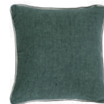
top Kaiyu Cushion in Seafoam $168