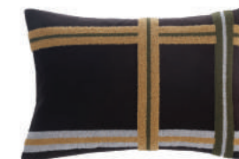
bottom Bryant Cushion $119.90