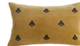
top Auro Cushion in Clay $119.90 middle Bebe Cushion in Olive $119.90 bottom Buzz Cushion in Gold $89.90